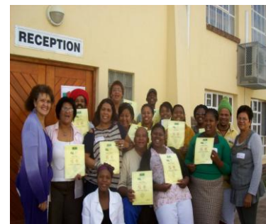
32 out of a 40 successfully completed their FAS training and received certificates